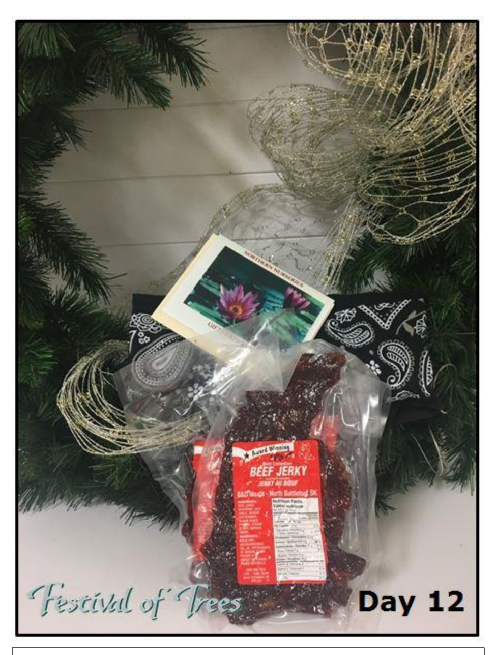
Day 12 will draw for a men's shirt donated by Mike's Sportswear, beef jerky donated by B&D Meat Shop and a gift certificate donated by Northern Nurseries.