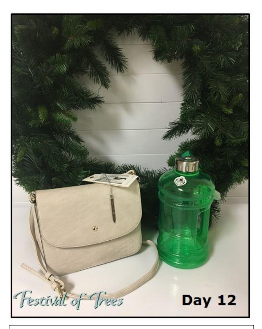
Day 12 will draw for a purse, necklace and water bottle donated by STIL Boutique & Beauty.