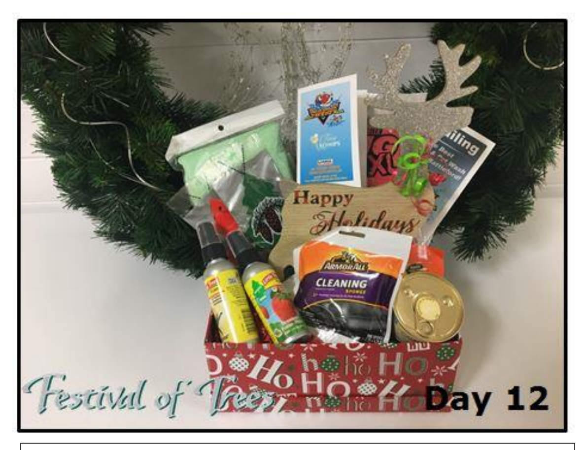
Day 12 will draw for a package donated by Splish Splash Auto, RV & Pet Wash.