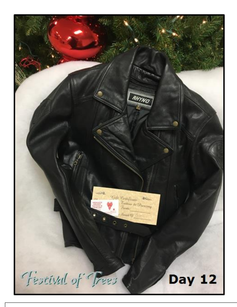
Day 12 will draw for a vintage women's leather jacket donated by Paul's Motorcycle Shop and a gift certificate donated by Dragon Heart Tattoo & Piercings.