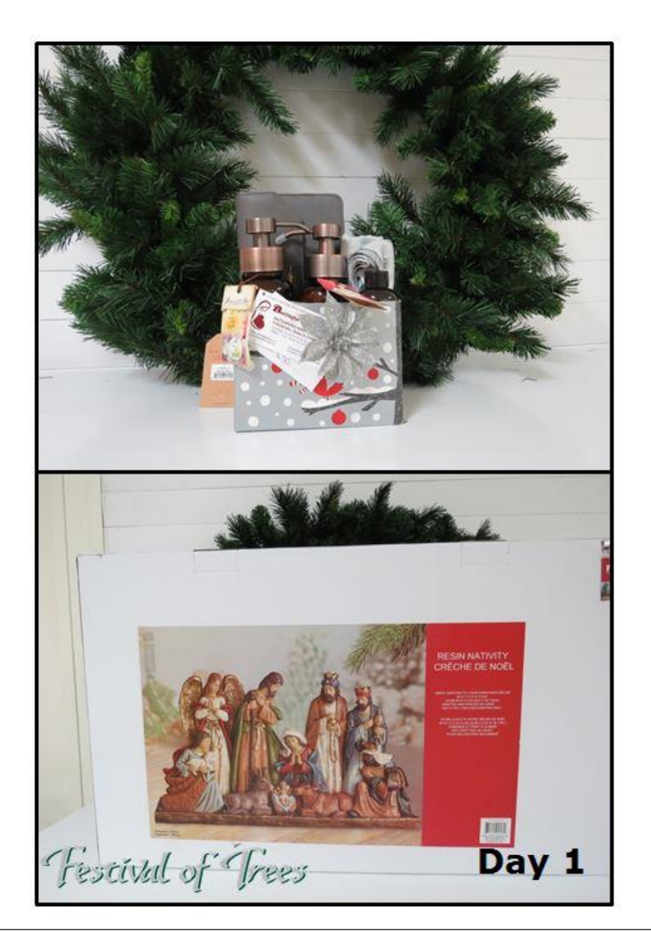
Day 1 will draw for a gift basket donated by Battleford Boutique together with a Nativity Scene donated by Peavey Mart – North Battleford.