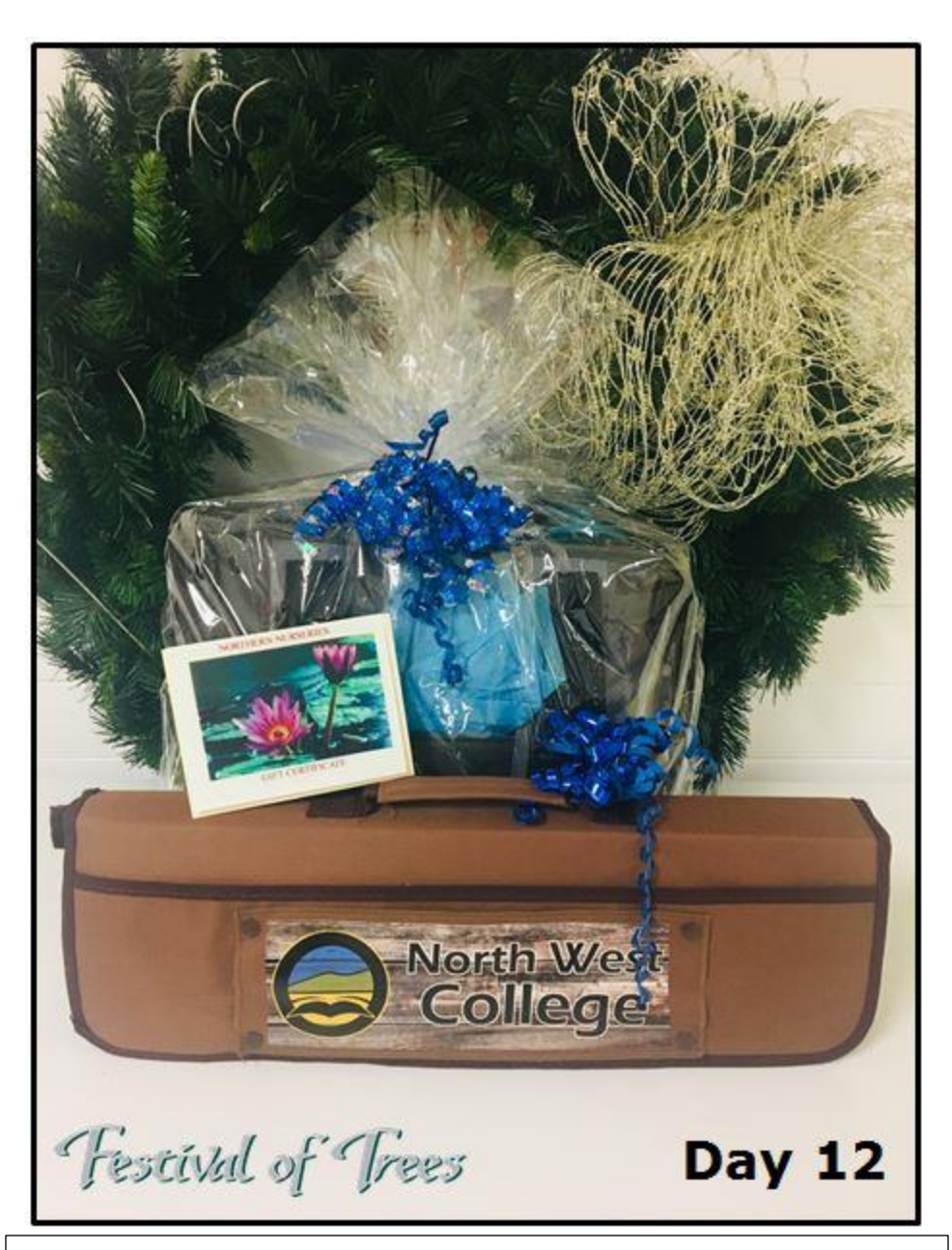
Day 12 will draw for a cooler bag and BBQ toolkit donated by North West College and gift certificate donated by Northern Nurseries.