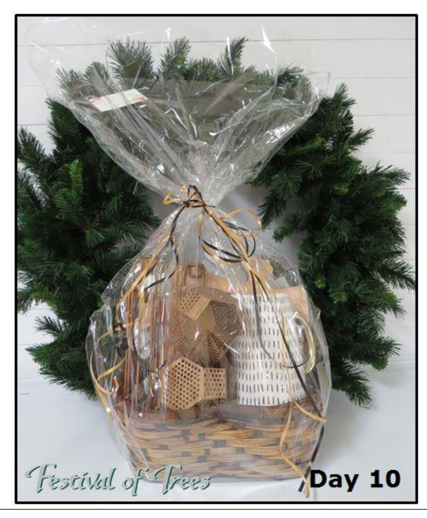
Day 10 will draw for a gift basket donated by Chic & Shabby.