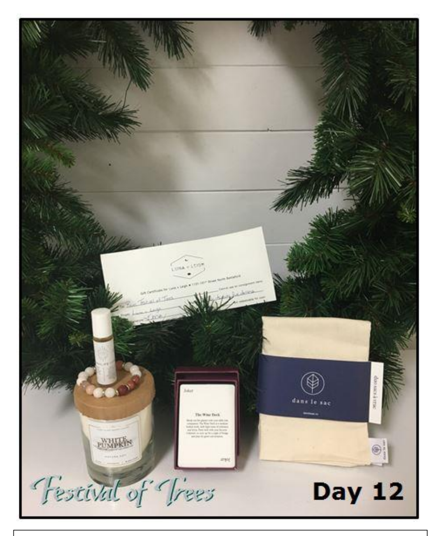
Day 12 will draw for a package donated by Luna + Leigh.