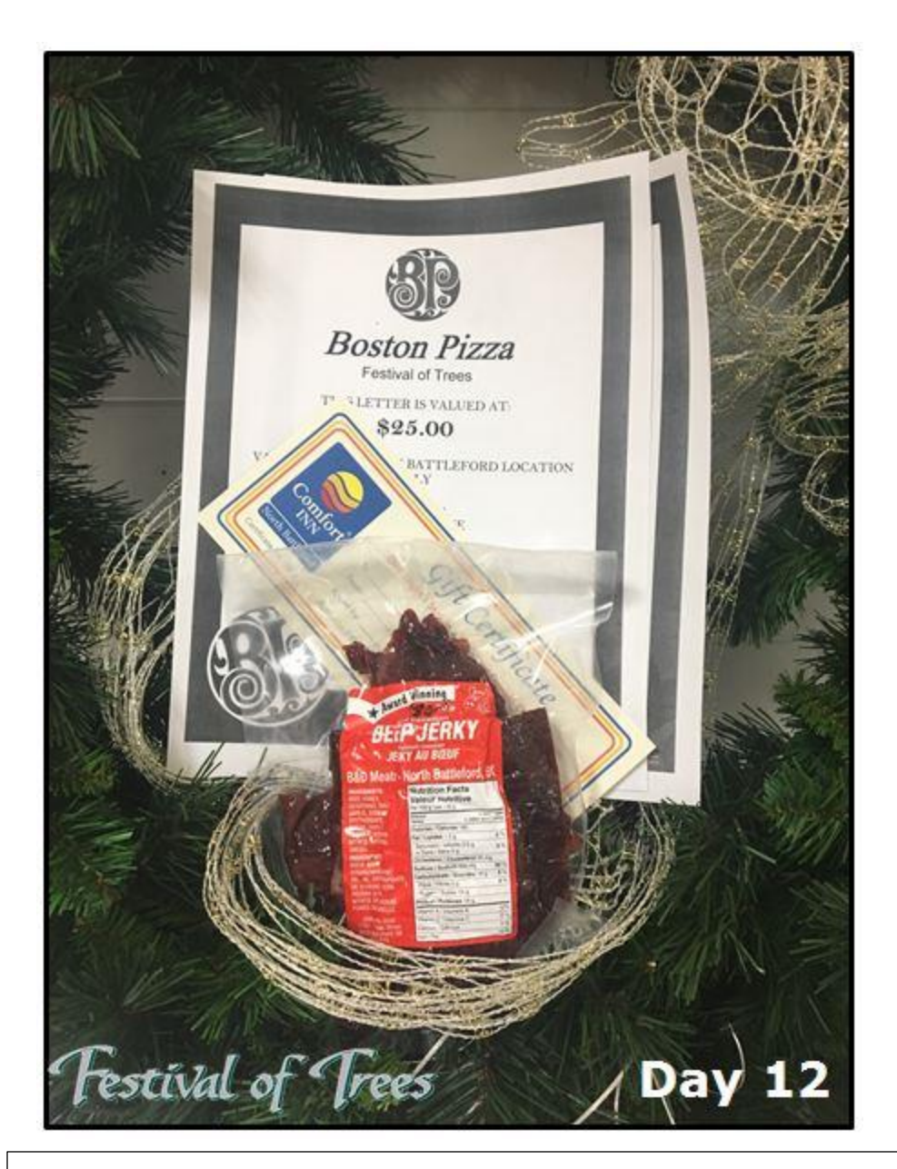
Day 12 will draw for gift certificates donated by Boston Pizza, a one night's stay donated by Comfort Inn and beef jerky donated by B&D Meat Shop.