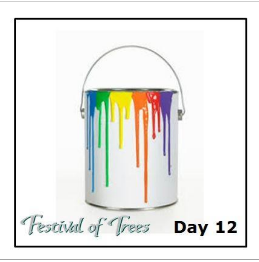
Day 12 will draw for a gift certificate from Doug's Paint Shoppe Inc.