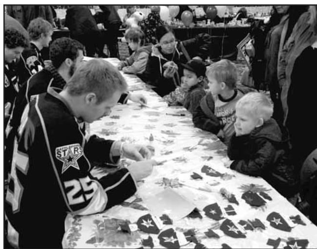
North Stars Junior A hockey players helping to make tree ornaments at Festival of Trees